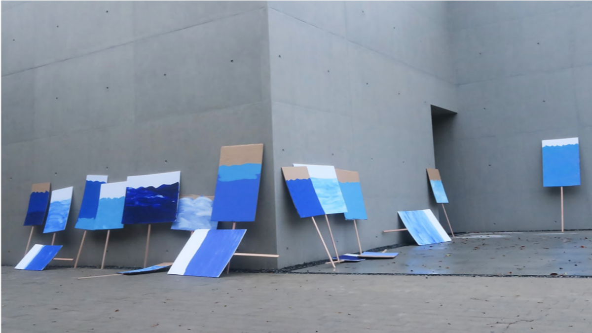
Large scale installation by Brussels based student applying to US BA programs.