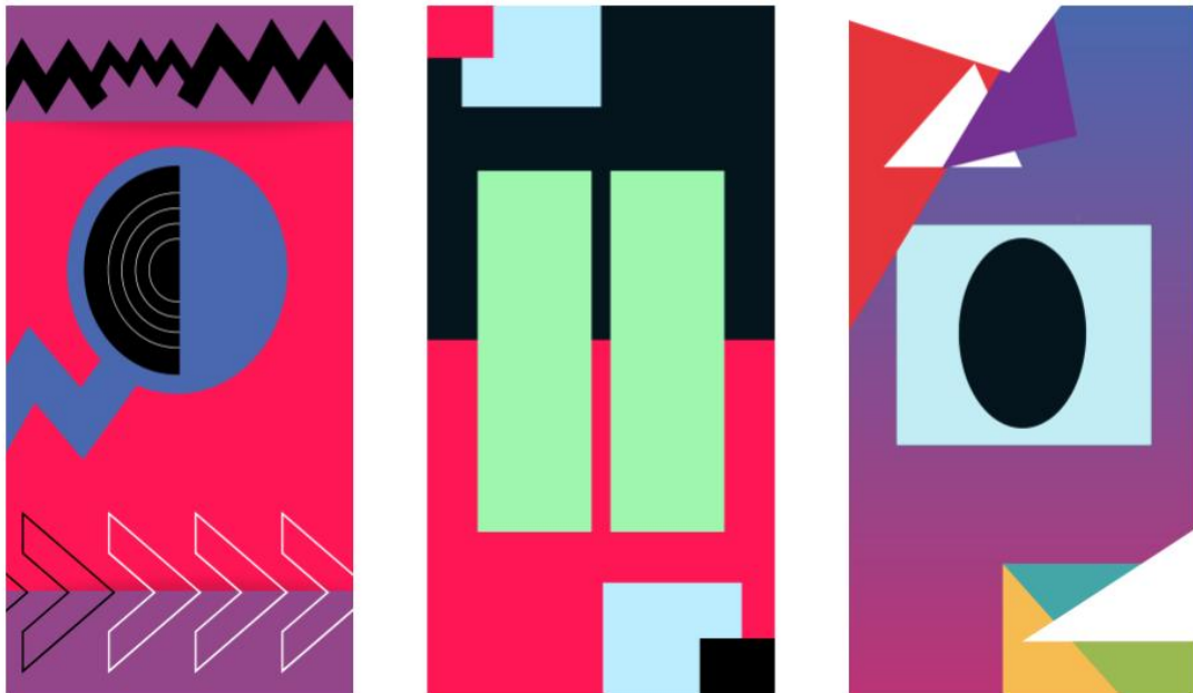
Digital designs by a Paris based student applying to UK Film programs.

Click here for more info on the Pre-College Summer Program!