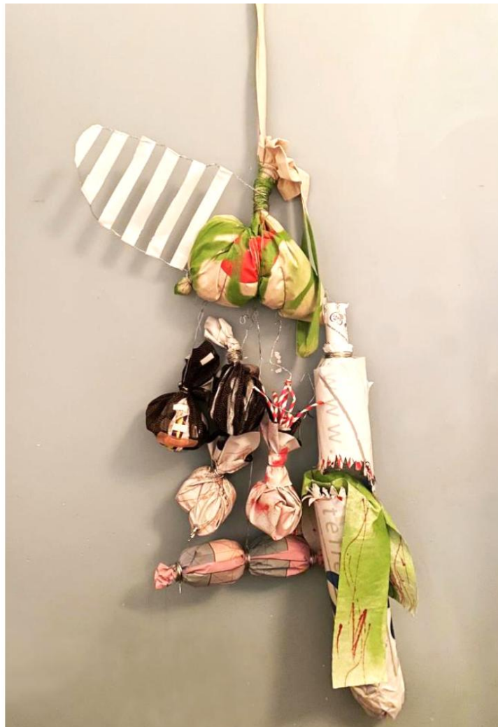
Sculpture made by a Paris based student applying to European Design programs.